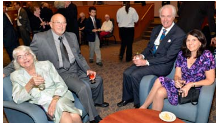
▲ Guests enjoying "hangar flying," refreshments and displays during the reception