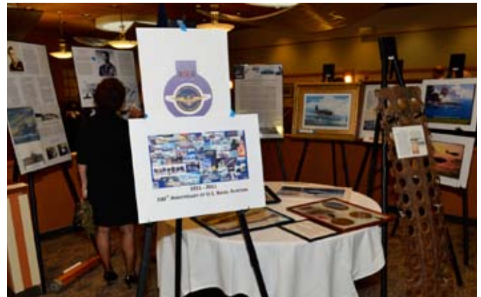
▲ Display celebrating the 100th anniversary of U.S. Naval aviation