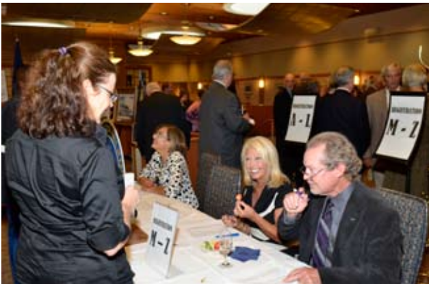
▲ Honors Banquet guest signing in at UD Clayton Hall