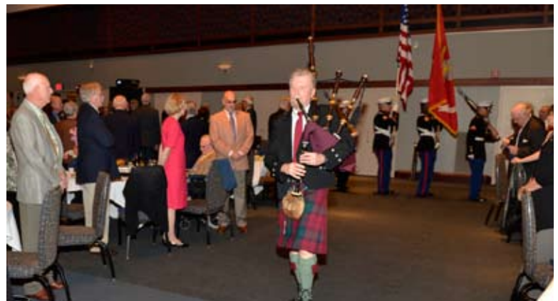
▲ Piper and Color Guard leading the opening procession into the banquet area