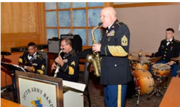
▲ Army National Guard "Stardust Knights" combo providing musical background during the reception