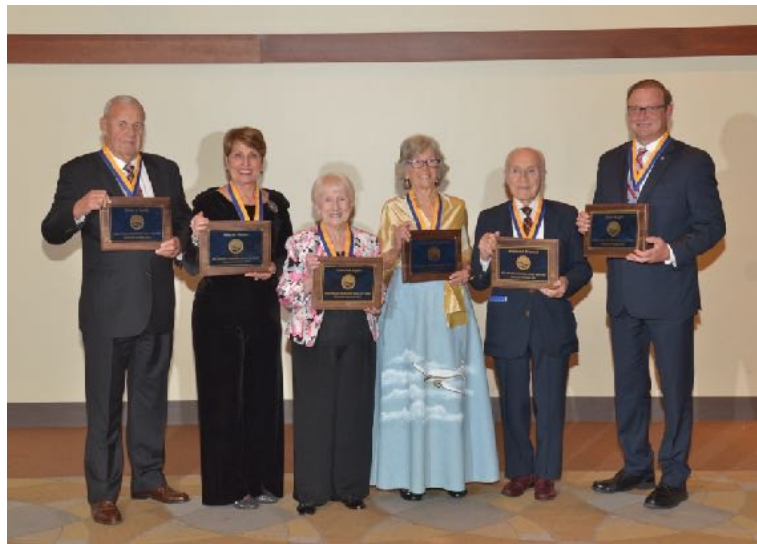
Hall of Fame 2017 Inductees

Tickets are now available for this event at the DAHF web site. Do plan on joining us for this unique and wonderful evening!